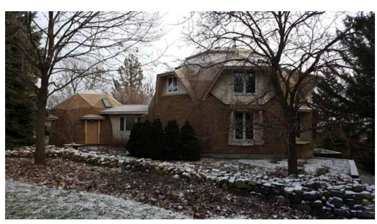
Jim Grober House