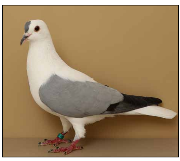
* Best Thuringer Wing Pigeon Blue Barless, OC 559 HS-96, Ron Smith

(Thuringer Wing Pigeon) (13) Blue Barless - Young Hen S94 520 Ron Smith S94 519 Ron Smith Blue Barless - Old Hen S95 1167 Ron Smith S94 588 Ron Smith Ron Smith S94 337 Blue Barless - Old Cock HS96 * 559 Ron Smith S95 557 Ron Smith Blue Black Bar - Young Hen S93 547 Ron Smith Blue Black Bar - Old Hen S93 325 Ron Smith Blue Black Bar - Old Cock S95 277 Ron Smith Blue Check - Old Hen 824 S94 Ron Smith Silver Dun Bar - Old Hen S94 351 Ron Smith Silver Check - Old Cock 1181 Ron Smith