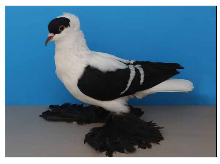
Saxon Fullhead Swallow Black White Bar YC 894 Chris Auer