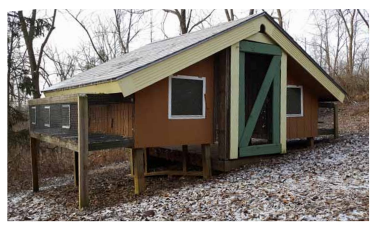
Jim Grober Breeding Loft