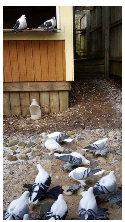
Jim Grober Swallow Loft birds feeding