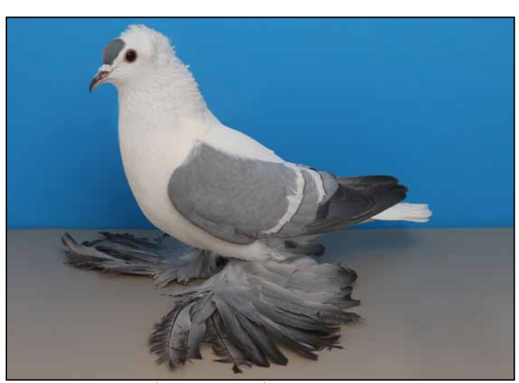
* Best Fairy Swallow Blue White Bar, OC 124 *E97, Mike Swanson