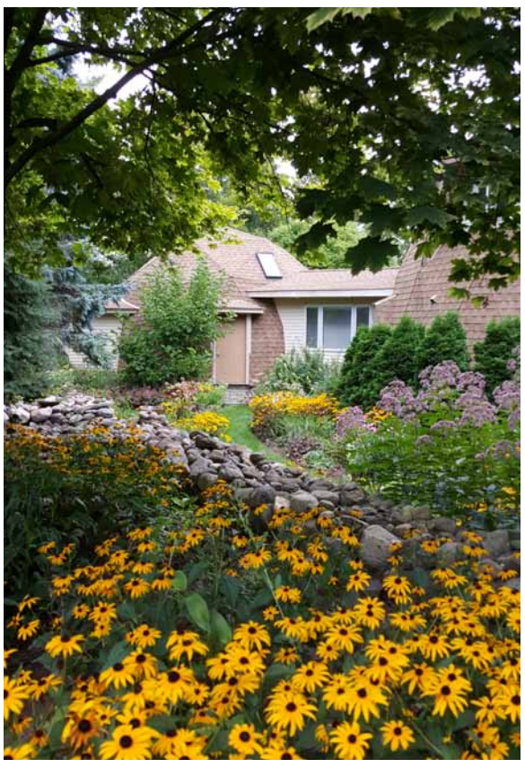
Jim Grober Summer landscaping