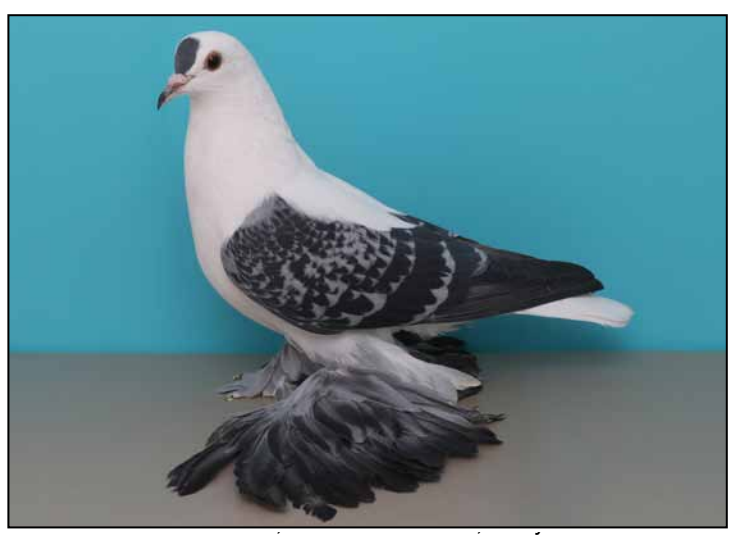
** Reserve Champion Blue Check, OC 158 E-97, Mike Swanson