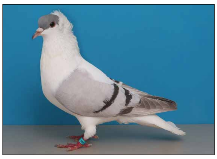
* Best Thuringer Swallow, Silver Dun Bar, OC 429 HS-96, Brad Stuckey