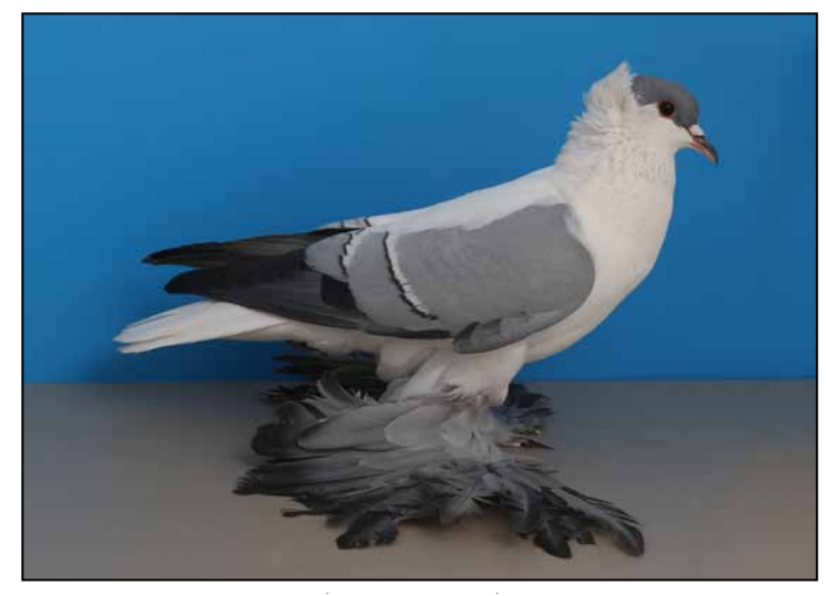
* Best Saxon Fullhead Swallow Blue White Bar, YC 19-964 HS-96, Perry Mueller