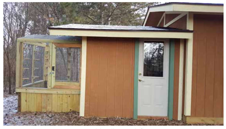
Gold Collar new loft